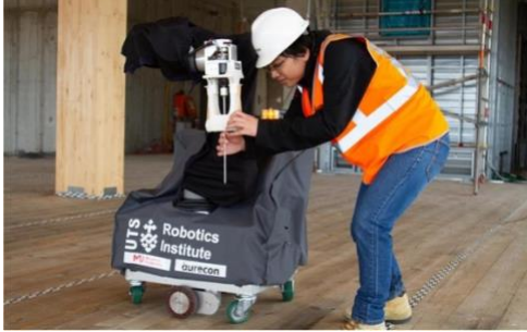
Figure 2. Intelligent robot prototype with human operator feeding screws

Workers could monitor the operation and view live data through a simple user interface. At the point of prototype deployment onsite, a human operator was needed to feed the screws to the robot as the self-feeding mechanism was not ready due to time constraints. The prototype and human worker feeding the robot is shown in Figure 2.